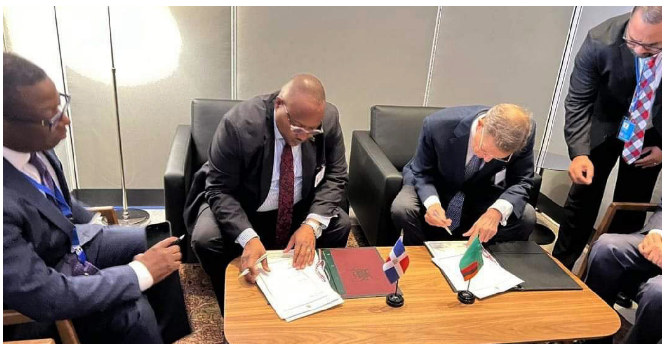
Hon. Haimbe signing a joint communiqué establishing diplomatic relations with Panama (top), the Dominican Republic (above), and St Vincent and the Grenadines.