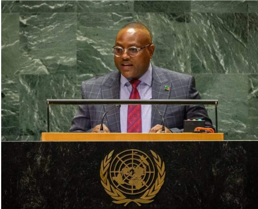
Hon. Haimbe addresses the General Debate of the 79th Session of the United Nations General Assembly on 28th September 2024

HONOURABLE Mulambo Haimbe, SC, M.P., Minister of Foreign Affairs and International Cooperation, on 28 September 2024, addressed the high-level General Debate of the 79th session of the United Nations General Assembly at the UN Headquarters in New York.