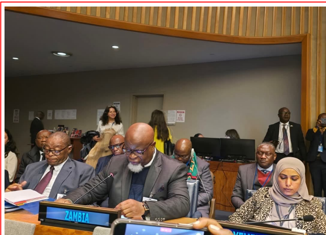
Minister of Health, Hon. Elijah Muchima, MP speaking at the 58th Session of the United Nations Commission on Population and Development held in April 2025 at the United Nations Headquarters in New York

At the 58th session of the United Nations Commission on Population and Development held at the United Nations Headquarters in New York from 7 th to 11 th April 2025, Minister of Health, Hon. Elijah Muchima, MP, reaffirmed the government's commitment to strengthening multi-sector collaboration in addressing Non-Communicable Diseases (NCDs). This commitment is part of a broader effort to implement policies aimed at improving health outcomes and aligning with international development goals.