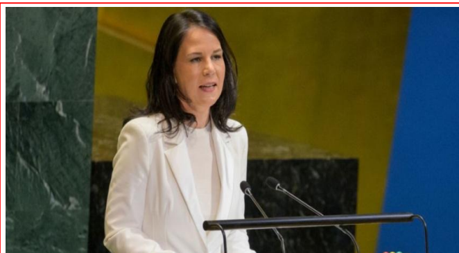
H.E. Ms. Annalena Baerbock speaking after her election as President of the 80th United Nations General Assembly in June 2025 in New York.

The United Nations General Assembly on 2nd June 2025 elected H.E. Ms. Annalena Baerbock of Germany as President of the 80th United Nations General Assembly, becoming only the fifth woman to hold the role in 80 years. She got 167 votes following the secret ballot while her compatriot Ms. Helga Schmid got seven votes. Ms. Baerbock represents the Western European and Other States Group. She takes over from His Excellency, Mr. Philemon Yang of Cameroon who served as President for the 79th session. Ms. Baerbock's presidency focusses on the theme "Better Together", promoting inclusivity, transparency, and dialogue. She outlined her priorities as modernisation of the UN through reforms and better financing, accelerating the Sustainable Development Goals (SDGs), promoting inclusive multilateralism, including gender equality and youth engagement. Ms. Baerbock's election received praise from global leaders, including UN Secretary-General António Guterres, who called it a historic moment for multilateralism and gender representation. Baerbock's leadership is seen as a chance to rebuild trust, advance reforms, and ensure the UN delivers tangible results in today's complex global landscape.