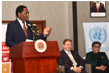
Mr. Hakainde Hichilema, President of the Republic of Zambia, delivered remarks during the official opening of the 3rd Least Developed Countries (LDC) Future Forum on April 1, 2025, in Lusaka