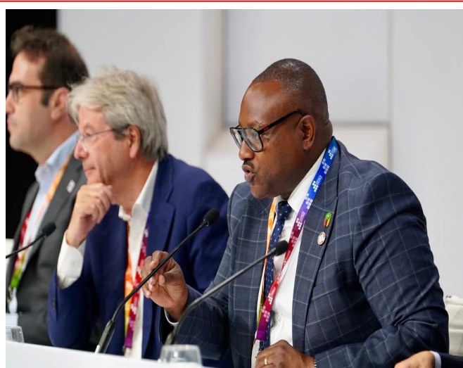
Hon. Mulambo Haimbe, S.C. MP, Minister of Foreign Affairs and International Cooperation, Speaking at the Borrowers Forum in July 2025 in Seville, Spain

Zambia has reaffirmed its commitment to strengthening global collaboration on debt sustainability by offering to host the inaugural Borrowers' Forum, an initiative endorsed during the Fourth International Conference on Financing for Development (FFD4), held on 3rd July 2025 in Seville, Spain.