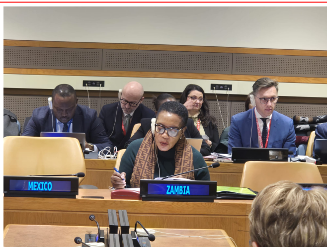
Speaker Mutti at the IPU Hearing in February 2025 in New York

Speaker of the National Assembly of Zambia, Ms. Nelly B. K. Mutti, SC, MP, FAPRA participated in the Inter-Parliamentary Union (IPU) hearing held at the United Nations Headquarters in New York on February 13-14, 2025. The event, themed "Scaling Up Action for the Sustainable Development Goals: Finance, Institutions, and Politics," brought together parliamentarians, policymakers, and financial experts to address gaps in SDG implementation. The hearing focused on scaling up actions for achieving the SDGs through finance, institutions, and politics.