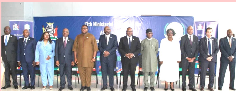
Hon. Ambrose Lufuma, Minister of Defence (6th from left), Hon. Mulambo Haimbe (7th from left), S.C. MP, Minister of Foreign Affairs and International Cooperation, and other high-level officials gather for a family photo at the 13th Ministerial Meeting of the African Union C-10 Heads of State and Government in June 2025 in Lusaka

adoption of the proposed African Union reform model, and proposed roadmap. The Minister noted the consensus reached on language to be advanced during the upcoming 80th Session of the United Nations General Assembly. Hon. Timothy Musa Kabba, Minister of Foreign Affairs and International Cooperation of the Republic of Sierra Leone in his capacity as coordinator of the C-10 Ministerial committee stated that the outcomes adopted during the meeting, including the Lusaka